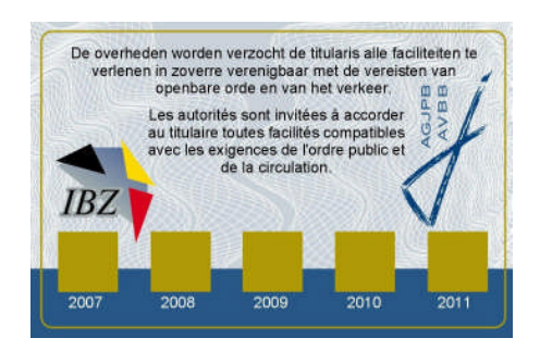
Belgium Press Card (back)